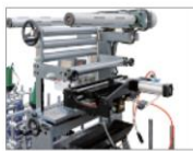
Glue Spreading Machine Head